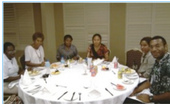
Participants of the conference