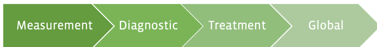
Figure 3. Continuum of mHealth tools 8

Although many mHealth apps currently exist, there is still a need for improvements. The utilisation of mHealth tools continues to increase. However, this can pose a problem for those who do not wish to download multiple apps. There