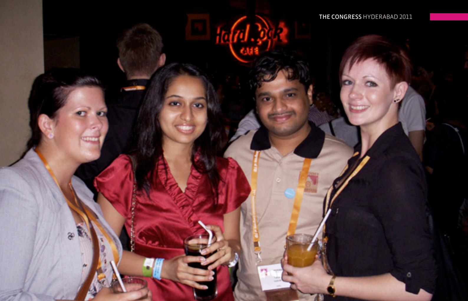
Members of the Young Pharmacists Group at the Hyderabad YPG night

It is also important to understand that face-to-face networking is not the only form of networking available. Online networking has quickly become the means of many companies of growing their circle of business contacts and publishing their services. Many barriers such as affordability to attend conferences or spending cash on 'wining and dining' clients are eliminated. Time zone differences are also greatly reduced.