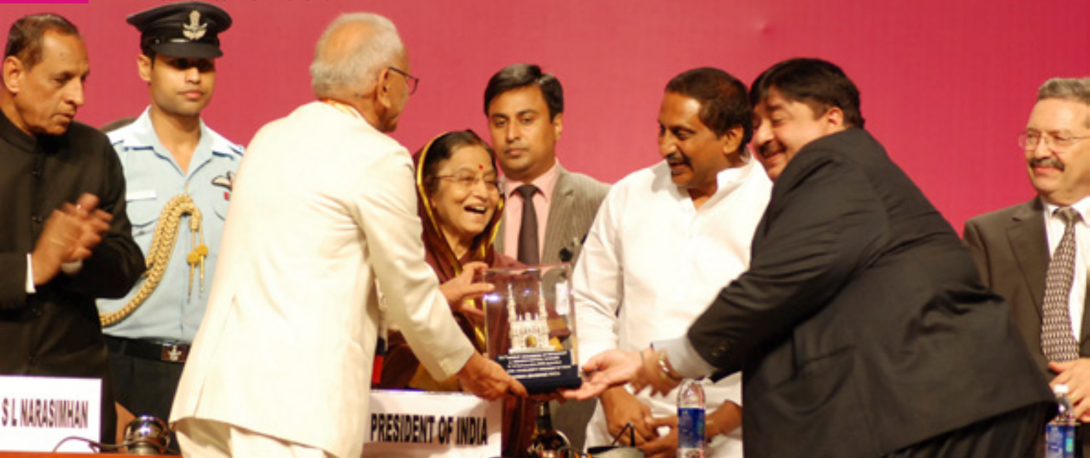
President of India receives gift at FIP Opening Ceremony

medications with a prescription (and not OTC), and to help strengthen and support TB management practices.