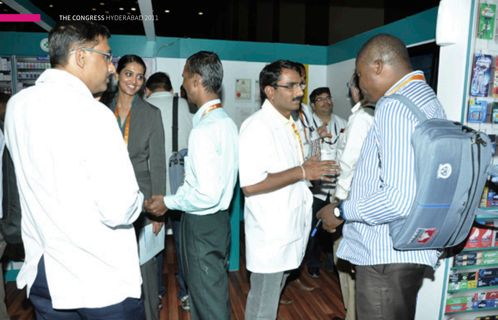
Visitors to the Exhibition